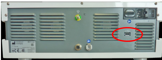
Fig. 1 USB port