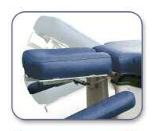
TILTING HEADPIECE Hand lever releases the headpiece

to lock at any angle from 30° positive to 30° negative.